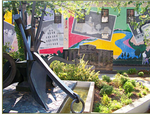
One of Greenfield's many colorful murals beside the Vietnam Veterans War Memorial on Main Street. Click on photo to enlarge.

Besides popular breakfast pitstops conveniently located right in downtown Greenfield, there are lots of other eaterie, be it Thai or Mexican, pubs or pizza.