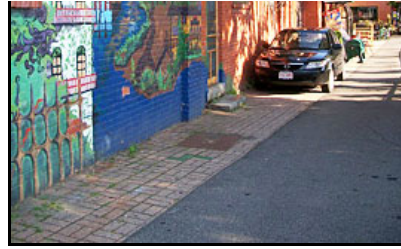
Wall art brightens the corner at Antonio's Pizza.