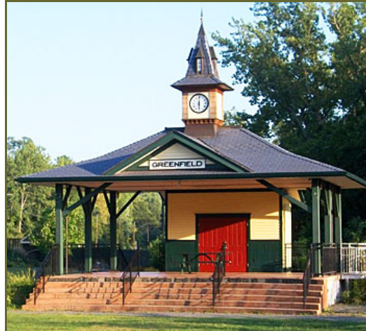
The entrance to Greenfield Energy Park, where you can often find live music and other local events any time of the week. Click on photo to enlarge.

She found the little city to be a solid medium