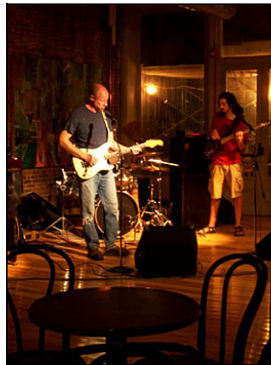
Musicians practicing in the newly renovated Arts Block

Part of the Bank Row Urban Renewal Zone, The Arts Block is a multi-tiered building with a beautifully open atmosphere and great acoustics, full bars on both the first floor and basement level offering appetizers and drinks to go along with a night of local tunes.